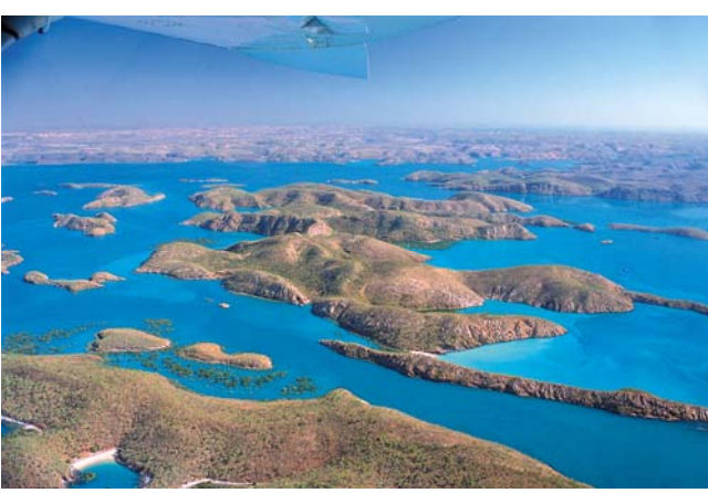
• Buccaneer Archipelago