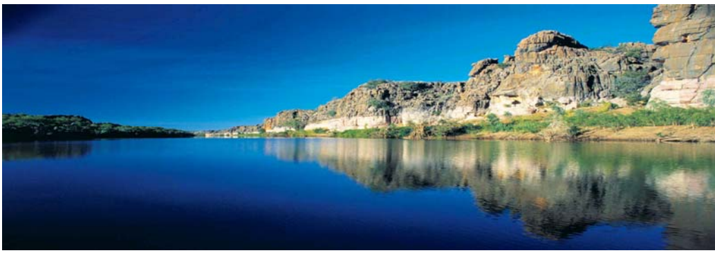
▪ Geikie Gorge, near Fitzroy Crossing