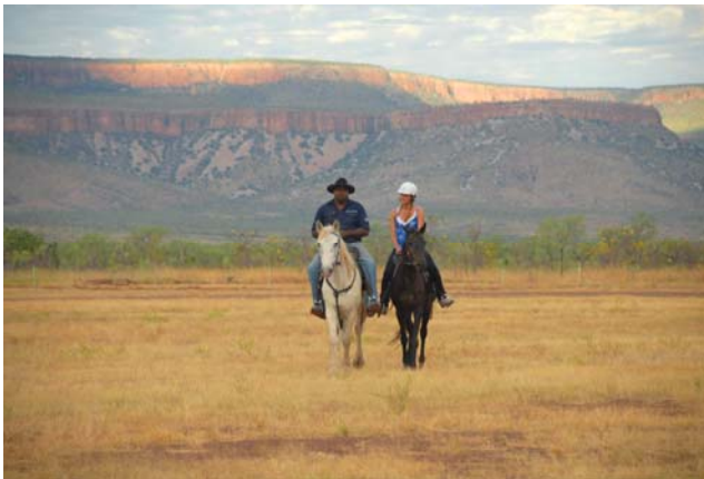
*Home Valley Station

Transfer rates or 4WD hire available on application