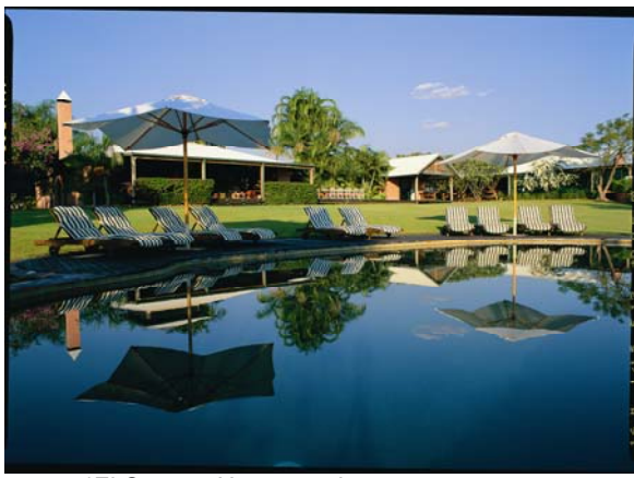
*El Questro Homestead