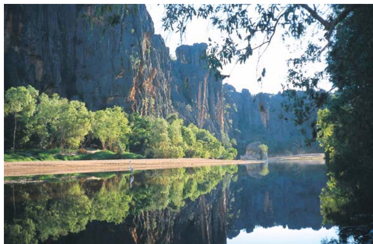
• Windjana Gorge

A great taste of the Kimberley outback in a day. We travel north across the Fitzroy River and break for morning tea near Derby at the Prison Boab Tree and Myall's Bore. We then join the famous stock route, the Gibb River Road and arrive at Windjana Gorge for a delicious freshly made picnic lunch. While here marvel at this classic feature of world geology and spot freshwater crocodiles. Then its time for an adventurous hike through Tunnel Creek in knee to thigh high water, view Aboriginal rock art and hear the story of Jandamarra, an Aboriginal legend of this region. Footwear and torches are provided for this walk. Enjoy an informative talk and the chance to view Aboriginal Art at the Mowanjum Art Gallery. Following afternoon tea, head back to Broome with a break enroute for dinner (own expense) arriving at 10.30pm. Travel in comfort aboard luxury 4WD vehicle.