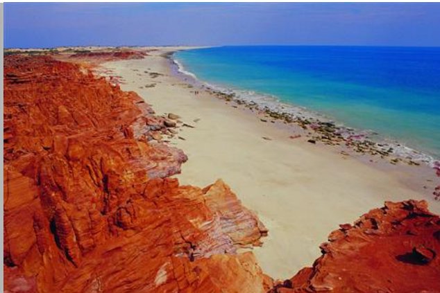
▪ Riddell Beach, Broome